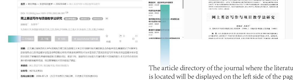
The article directory of the journal where the literature is located will be displayed on the left side of the page.